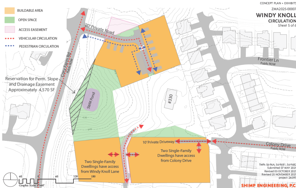
Figure 1: Sheet 5 of Attachment 4: Conceptual Plan - Windy Knoll Circulation